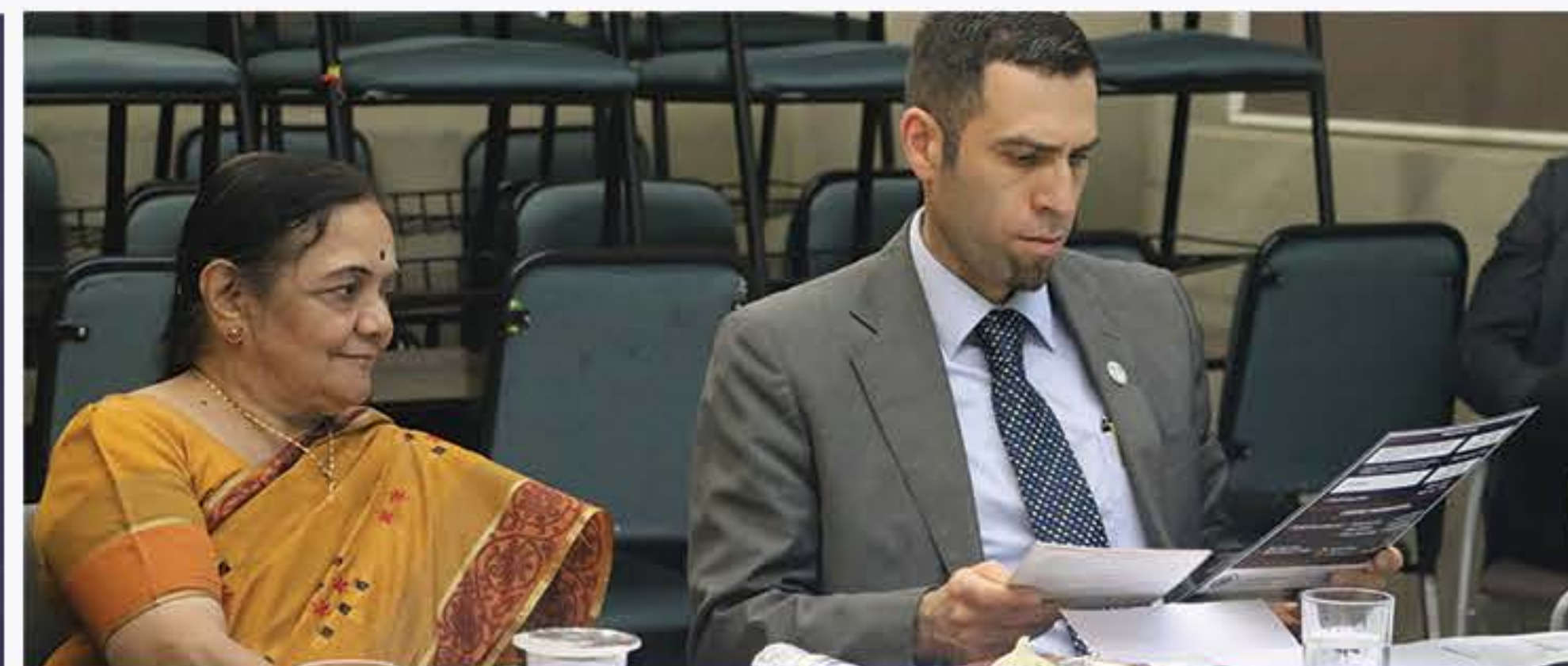
Consul General Mr. Yaakov Finkelstein, Consulate General of Israel, Mumbai